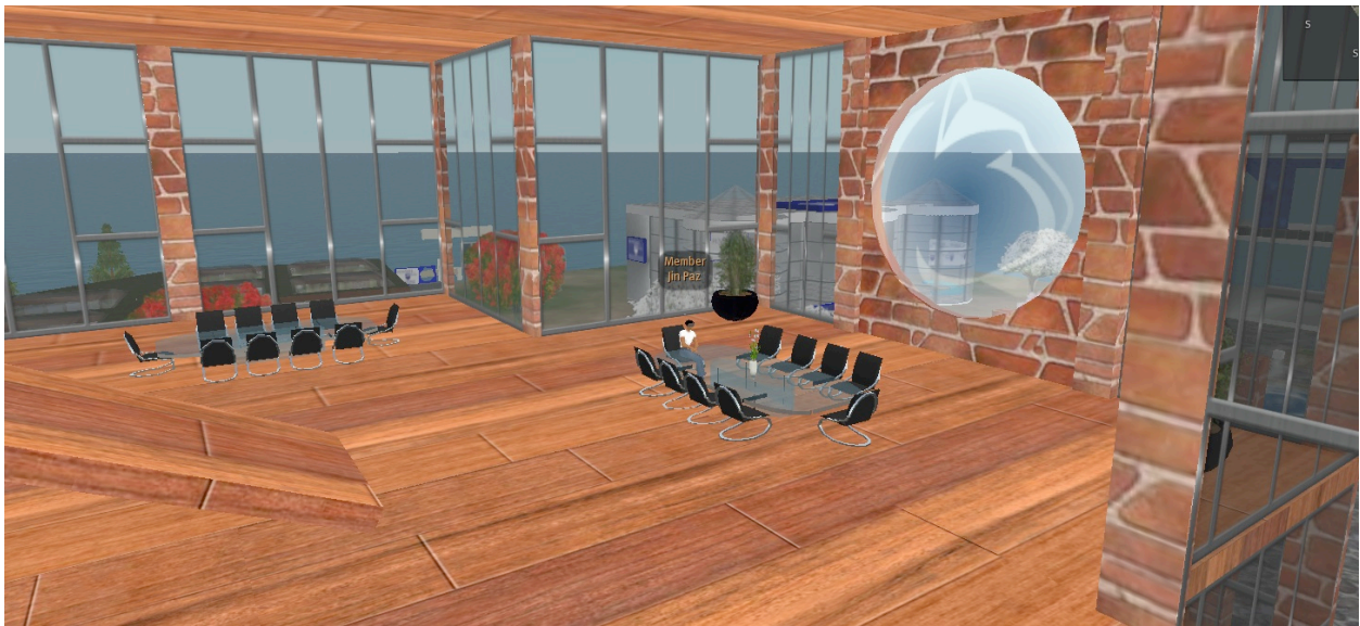
A formal gathering area.