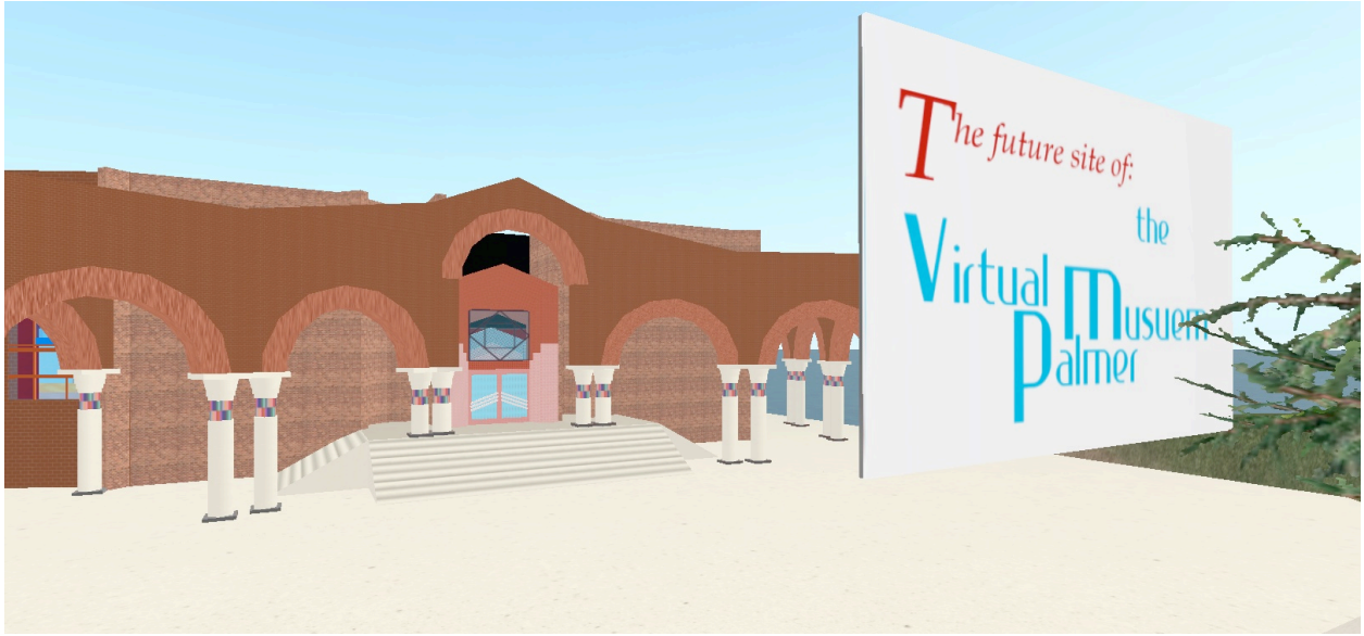
Virtual Palmer Museum.