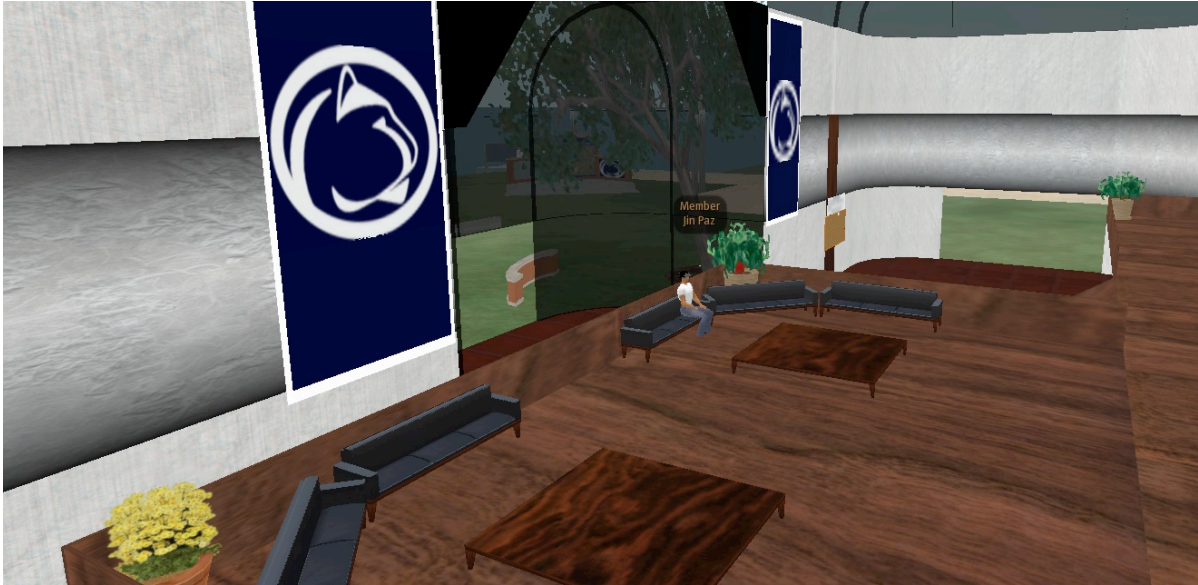
An informal gathering area.