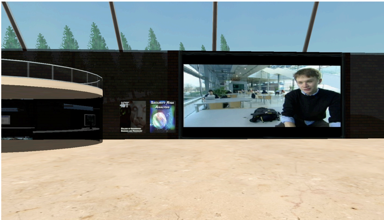
IST Welcome area. Video testimonials shown on big screen.